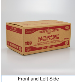
Front and Left Side