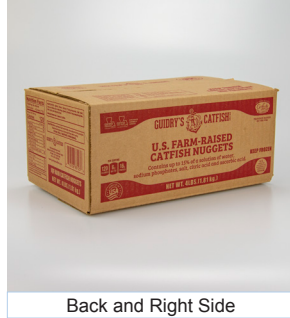
Back and Right Side