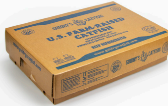
Front and Left side