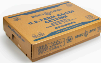
Front and Left side