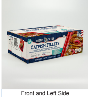
Front and Left Side