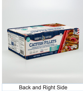
Back and Right Side