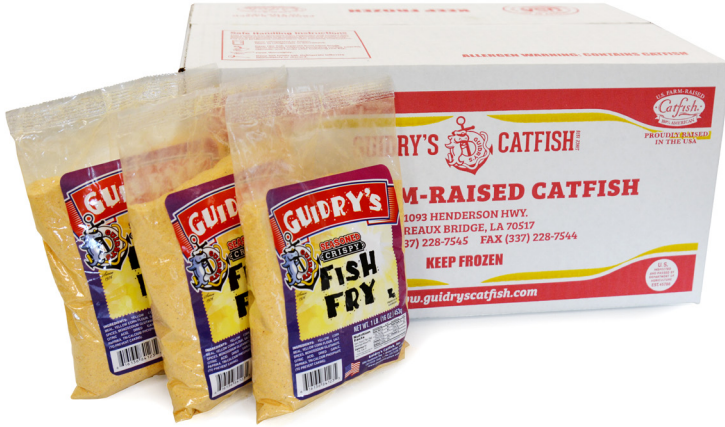
15 lb. box and 1lb bag Fish Fry