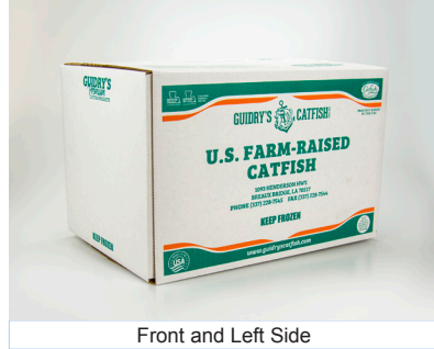
Front and Left Side