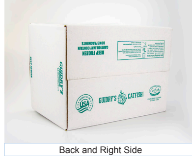
Back and Right Side