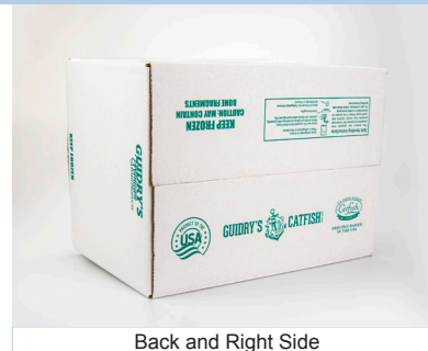
Back and Right Side