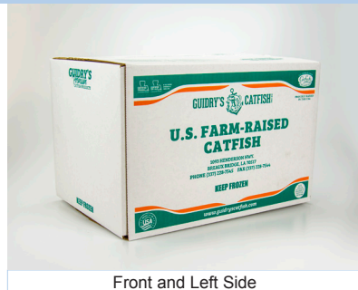
Front and Left Side