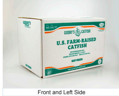
Front and Left Side