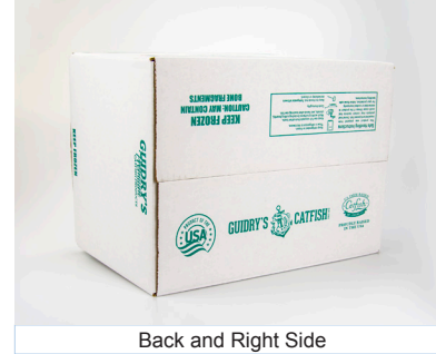
Back and Right Side