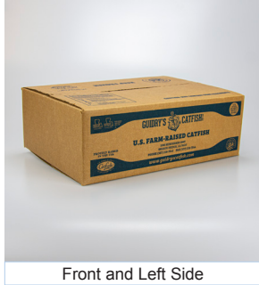
Front and Left Side