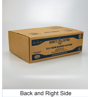
Back and Right Side