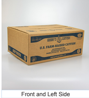
Front and Left Side