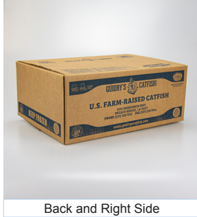
Back and Right Side